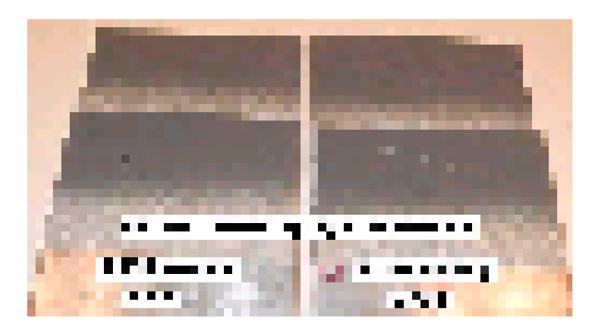
Figure 1. Typical NTST silicon nitride coatings

Current applications are found in the automotive, industrial bearing, aerospace, medical, and electronics industries. The largest market for silicon nitride automotive components is in engines and wear components. This includes glow plugs, combustion chambers, turbochargers, and exhaust gas control valves. The wear resistance, low friction, and high stiffness of silicon nitride improves the performance of high temperature bearings. Figure 1 illustrates typical NTST silicon nitride coatings (i.e. 5 and 10 mils thick). Figure 2 illustrates the as-sprayed surface morphology of a typical NTST Si3N4 coating (160x).