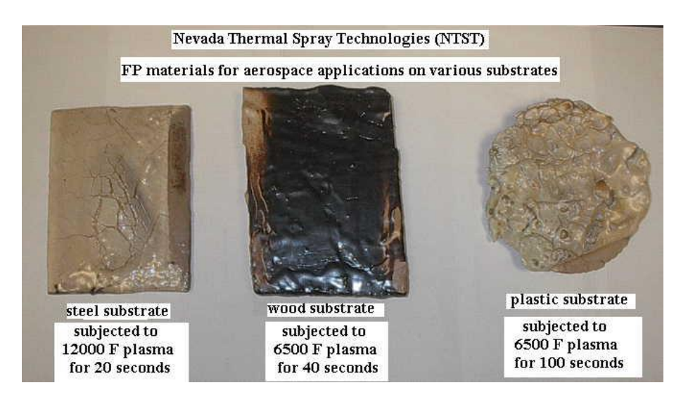
Figure 3. High Temperature Testing of NTST TP Coatings.

utilized to traverse the substrates in an x-y scan pattern. As illustrated in Figure 3, an 80 mil NTST TP coating thickness on steel was subjected to a 12000 F plasma temperature for 20 seconds. An 80 mil NTST TP coating thickness on wood was subjected to a 6500 F plasma temperature for 40 seconds. An 80 mil NTST TP coating thickness on plastic was subjected to a 6500 F plasma temperature for 100 seconds. In all cases there was no degradation of the underlying substrates.